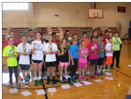
All the Diocese of Venice Regional Basketball Free Throw Winners